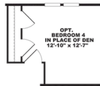
OPT. BEDROOM 4