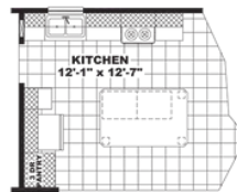
ALTERNATE KITCHEN W/ISLAND